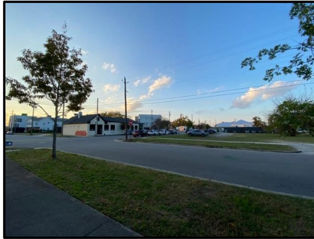
Figure 5: 4 th St. and Harnett St., location of the first shots fired.

The third site we visited was the 1898 Memorial Park (Figure 6), located a block away from 4 th and Harnett. The memorial was dedicated in 2008, and it represents the hard-earned success of individuals like Bertha Boykin Todd in raising capital to construct a public space that “influence[s] our understanding of the past” (Mattingly, 2008, p. 135). The artist Ayokunle Odeleye created the sculpture, which features six large paddles in a semicircle to symbolize water, “an important element in the spiritual belief systems in Africa and their descendants who resided in Wilmington during the 1800’s” (Todd, 2010, p. 130). The students noted how digital artists may align with Todd and Odeleye to claim “prized public space” (Mattingly, 2008, p. 140) to honor the victims and learn from the events of 1898.