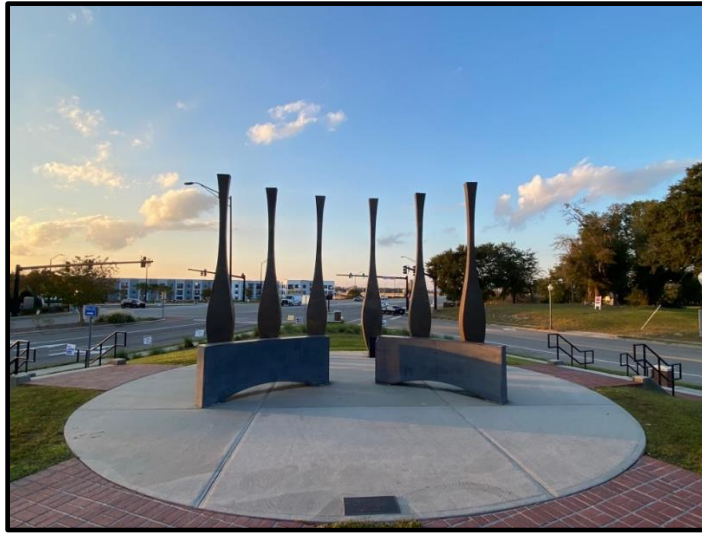
Figure 6: Photo of Ayokunle Odeleye’s installation at 1898 Memorial Park.