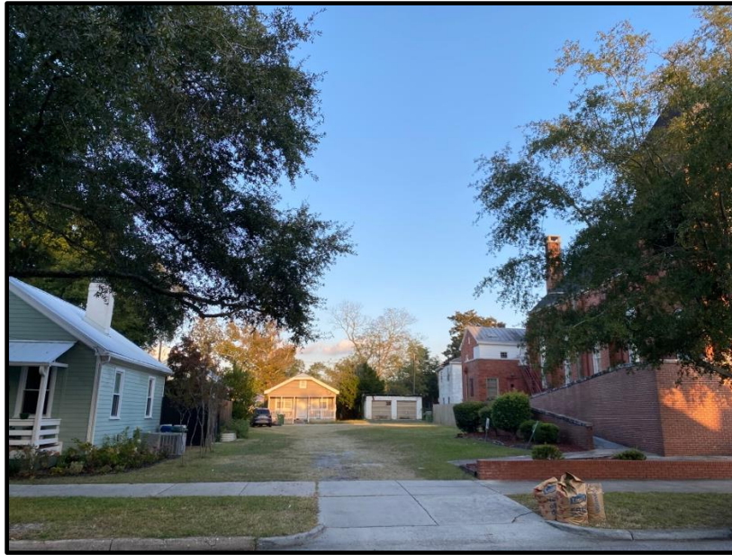
Figure 3: Photo of the location of The Daily Record, now an empty lot.

We visited the location of The Daily Record first (Figure 3). We parked along the narrow city street and stood, phones in hand, in front of what is now an empty lot. On the left side of the lot is a house with a historical plaque indicating the home's construction date and the names of its historical owners. On the right is the Saint Luke AME Zion Church. In between is an empty lot, the former location of The Daily Record, owned and now used for parking by the church. No sign or plaque marks the burning of the newspaper, and the students are horrified. The location itself is nondescript, contrasted with a photograph of the Red Shirts after having burned The Daily Record. In the photo, the second floor of the building is charred, and a large mob of white men stand with rifles and smiles, posing for the picture. The empty lot juxtaposed with the photograph imparted an odd feeling of silence, and the students described it as surreal and somber. Later, one student described the empty lot as painfully underwhelming. To test Popwalk on location, students watched a placeholder video. They noted some usability problems but also emphasized how such an app could help reframe the experience of standing in front of the lot. From this location, we drove four blocks east to drive by the historical marker of Alex Manly, located on a downtown main street. Figure 4 shows the text of this marker. Other scholars have noted the problematic language on this sign, as did the students.