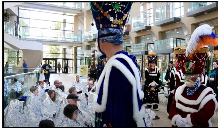
Figure 2: screenshot of Rojas's "Cage" video

video montage) and the site-specificity, Rojas invites viewers to connect racist, local past events and spaces to current day examples, also revealing a very in-the-moment example of how such histories are erased. The site-specificity encourages users to identify with past and present examples of racism and human brutality while at the same time acknowledging that the innocent-looking housing unit in front of them is yet another example, another layer, of such history.