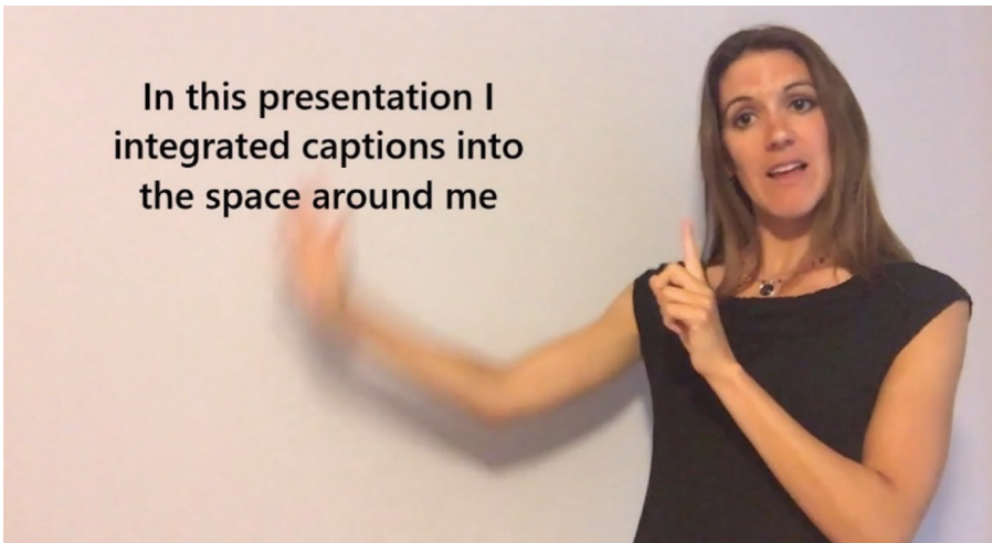
Figure 3.2. Screen capture from the author's dissertation video.

I intentionally planned for and integrated the captions into this video so that the captions would embody my multimodal message—and my professional voice as a signer (as depicted in Figure 3.2). When filming myself, I positioned myself so that the camera framed me from the waist up (a medium shot) and with space to my sides. Determining that black font would be the most readable color for my captions in this professional presentation, I stood in front of a light-colored wall and wore a black shirt that contrasted with my light-skinned hands and arms.