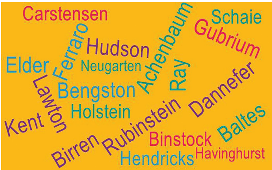
Figure 10.3. Word cloud of widely cited scholars in gerontology.

In Figure 10.2, the interdisciplinary nature of the field of gerontology is represented using a Venn diagram. “Social Gerontology” appears in a beige circle in the middle of the figure. The names of other fields appear in shapes that surround and overlap with Social Gerontology. Starting at the top and moving clockwise are the following fields: psychology, age and gender studies (also overlaps with medicine and allied health), demography (also overlaps with sociology and medicine and allied health), sociology (also overlaps with demography and medicine and allied health), social work and welfare (also overlaps with medicine and allied health), medicine and allied health (also overlaps with age and gender studies, demography, sociology, social work and welfare, and community and public health), and community and public health (also overlaps with medicine and allied health).