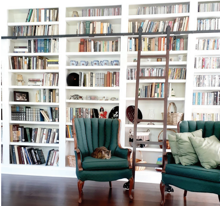
Figure 8.3. The author's home library.