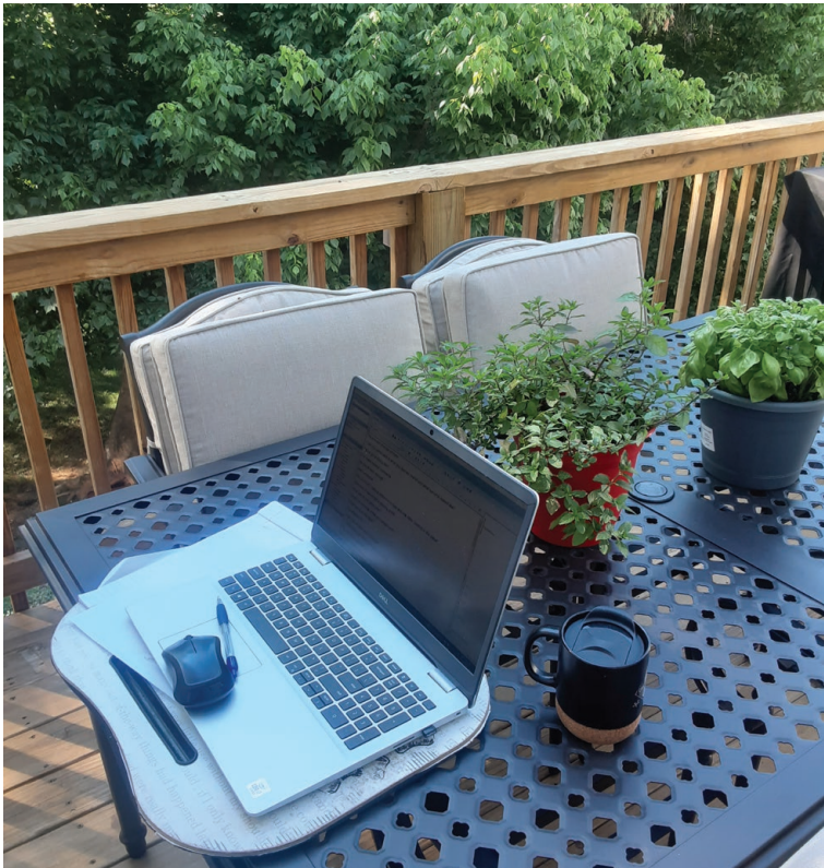
Figure 8.5. The author's back porch and laptop, where she both worked and relaxed during the stay-at-home period.

As I think about beauty in the sites of my academic work, I have to confront a difficult reality: my privileges. I looked again at my data for evidence of advantages in my staying-at-home that I might not have paid attention to before, beyond the comfort of the space in which I was working: I had freshly ground coffee (mentioned four different times), I had internet access, I had a reliable laptop (Figure 8.4), and I could stop when the work made my head spin and play a game of badminton with my 15-year old son, or take a long evening walk with my husband , or sit in the sun on my porch and watch the birds, chipmunks, and squirrels in our backyard (Figure 8.5). The objects mentioned in my data, from the honeysuckle vine (Figure 8.6) to the tower fan to the Pandora playlist, imply ease; despite difficulty in finding toilet paper, my time at home cannot qualify as hardship.