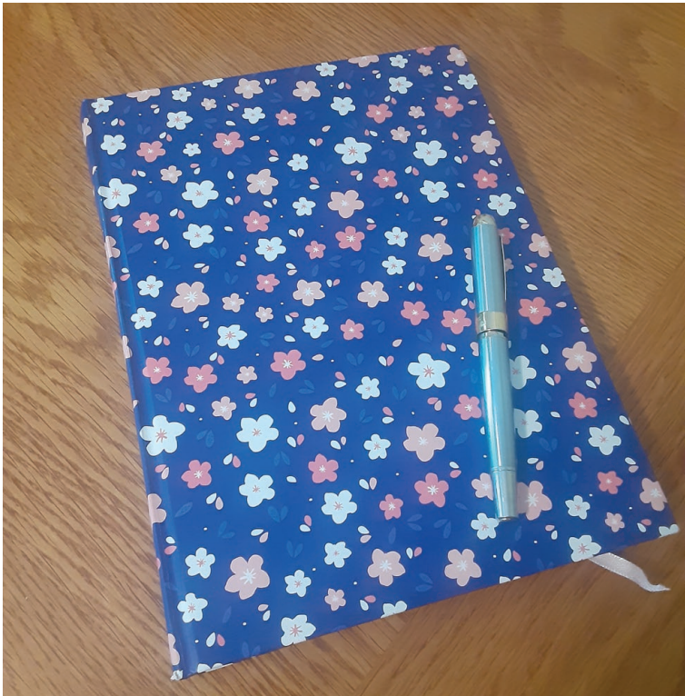
Figure 8.8. The author's journal.

The downward pull of weight and pressure also appears in my responses: under the strain, under the circumstances, under stay-at-home orders, under pressure . But seeing myself in the situation, not under it, created moments of joy and laughter, too. Once again, this simple act of framing the circumstance via a preposition may be a choice tied to privilege. To suggest otherwise would be cruel.