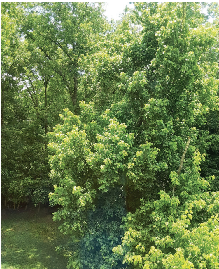
Figure 8.7. A corner of the author's backyard.

Even without concordancing data, I know the lexical range of my journal entries over those four days differs from the Documentarian survey responses: the words center on concern for my daughters (and their cats, quarantined with them in different states), anxiety for my husband, who was still working, the virus, PPE, the death toll in Italy, possible cures, laments and prayers. In the journal, I engage in soul-speak, the language of faith—words that are easy to quarantine, in a sense, away from the sphere of the academy.