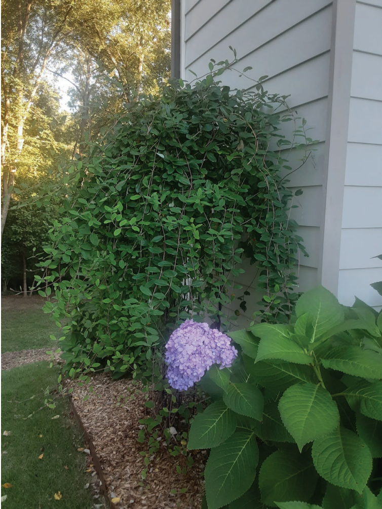
Figure 8.6. The author's honeysuckle vine.

Many of my first-year writing students do not share this privilege: some completed the semester without internet, without privacy, without quiet, without resources. The university tried to provide internet hotspots in campus parking lots, to reach out to struggling students, to ensure flexibility and accommodations. But my own words evoke privileges that my school and its well-meaning personnel cannot recreate or supply.