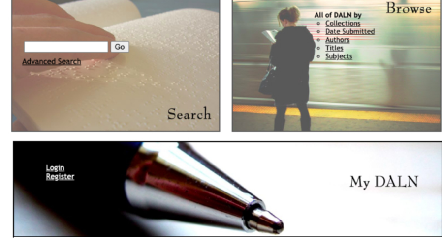
Figure 2: Original design of the DALN home page built on the DSpace platform.

humanities as in the sciences helps ensure long-term access, facilitates discovery, retrieval, use, and reuse, and maximizes the usefulness of the curated digital content" (2). With an overhauled technical infrastructure and added features that enhance accessibility, the resulting redesign is far more inviting and therefore useful to the public that we want to engage.